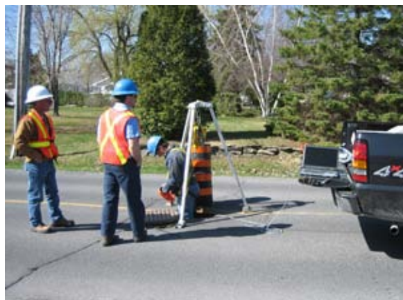
Manhole Location Selected for Flow Survey