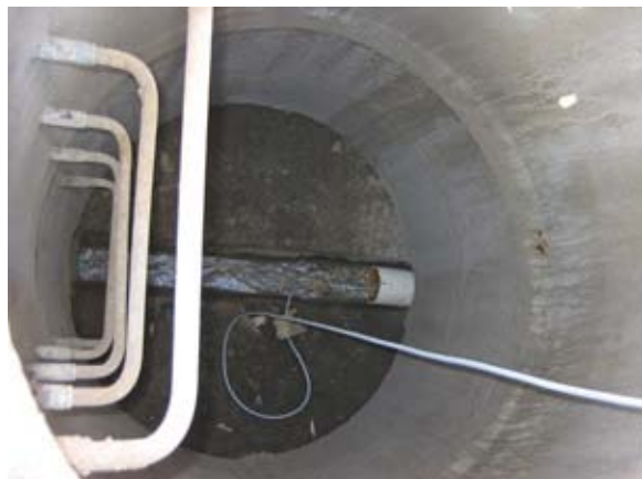
Level-Velocity Sensor Installation in Manhole Inlet Pipe

The study of the Glen Walter Sewage Collection was conducted from May 16 th to June 9 th 2006. The instrument's ultrasonic sensors were installed in 7 different manholes for periods of 3 to 5 days. To capture detailed flow information the Township set the Stingrays to take readings at 10 second intervals. To deploy each unit, a township technician selected a manhole location, attached a stainless steel bracket in the influent pipe, then mounted the sealed, ultrasonic sensor into it. The technician connected the sensor cable to the watertight electronic logging unit and hung it inside the manhole. The logger recorded the date and time, water level, velocity and temperature.