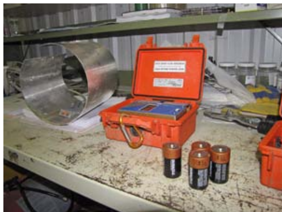
Stingray Level-Velocity Loggers Prepared for Deployment in the Sewage Collection System

observed corresponding temperature drops matching the pump cycles. The evidence was clear: residents were connecting sump pumps to the municipal collection system.